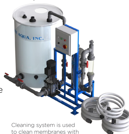
Cleaning system is used to clean membranes with Pure Aqua's PAClean-LPH and PAClean-HPH

PAClean-LPH is a mildly-acidic RO membrane cleaner for removing fouling caused by iron salts, oxides and hydroxides. It can also be used to remove calcium carbonate scaling.